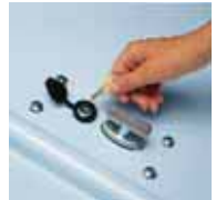
Keyed Lock Kit