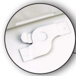
Flush, stainless steel cam latch opens with screwdriver