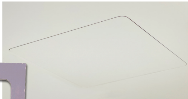
SEALED DRYWALL EDGES CORNER DETAIL