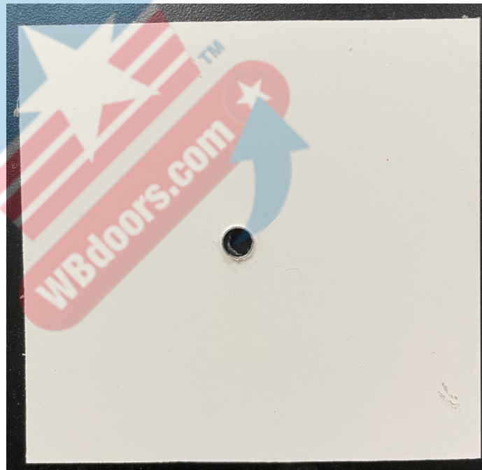
Figure 1. Specimen prior to testing.