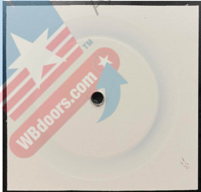
Figure 3. Sample after 4,000 cycles.